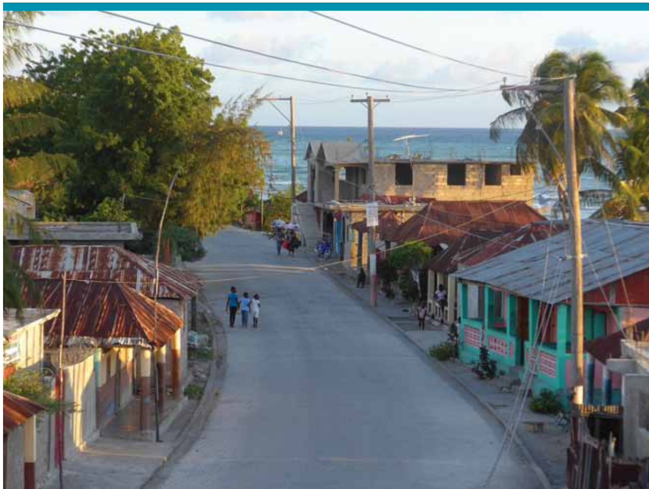
In Haiti, 19 US-based electric co-operatives and 37 volunteer linemen worked with the National Rural Electric Co-operative Association (NRECA) International to help build Haiti's first electric co-operative. The possibilities are now endless for three towns in the southwestern region of the country, because a better life starts with power.

desirable that smallholder farmers not only work together to set up primary/village level co-operatives, but that these co-operatives work together through secondary co-operatives to secure better market access, marketing and storage facilities. The creation of secondary and apex organisations is a helpful way to build strong producer organisations.