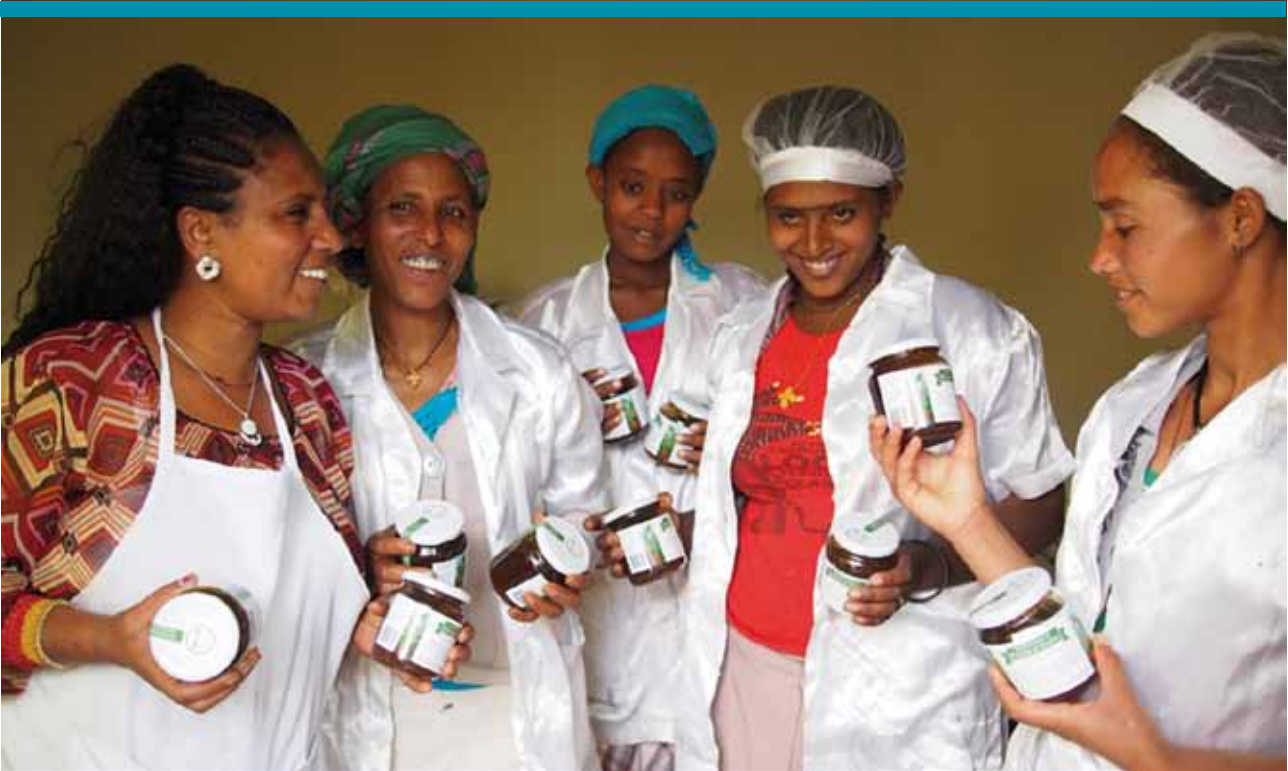
At Mekelle co-operative in Ethiopia , women learn to refine their traditional processes in making cactus pear marmalade. By fulfilling their economic potential, women achieve autonomy and independence to meet their own needs and grow as active participants in their communities.

New opportunities, such as the creation of secondary co-operatives, often required new forms of legislation. This highlights the need for co-operatives to be able to speak with one voice in such dialogue; co-operation among co-operatives in accordance with the 6 th Principle being the key to the successful promotion and defence of co-operatives.