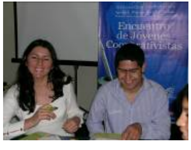
Young co-operators at the youth forum

the themes of education, employment and opportunities for participation, along with the possibility of forming co-operative youth connected with the social economy were offered.