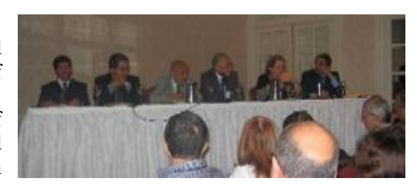
Panel on worker ownership

Both the workshop and the forum on associated work held in Buenos Aires as part of the 13th Regional Conference of ICA Americas focused on two fundamental issues: legislation on worker co-operatives, and the importance of worker co-operatives in the countries' new social and economic context due to their contribution to the generation of employment and social and economic wealth.