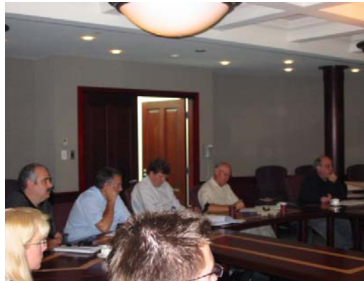
Students attending the August 2003 orientation programme at Saint Mary's. The students meet face to face twice during the programme – once in Halifax and the second time during a study visit to either Mondragon, Spain or Bologna, Italy

"Many never have the opportunity to learn what it means to properly manage a co-operative undertaking, often with disastrous consequences."