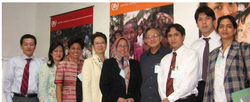
Participants at the recent ICA Asia & Pacific Regional Women's Committee meeting

Since the late 1990, ICA members have been asked to provide the Head Office with sex disaggregated statistics on members and employees. At the same the ICA Gender Equality Committee has asked its members to share information on women in decision-making positions. The information that exists is on the ICA GEC website: www.ica.coop/gender/stats.htm