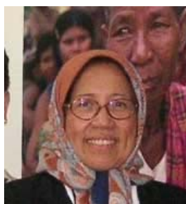
Hon. Senator Rahaiah Binti Baهران (Malaysia)