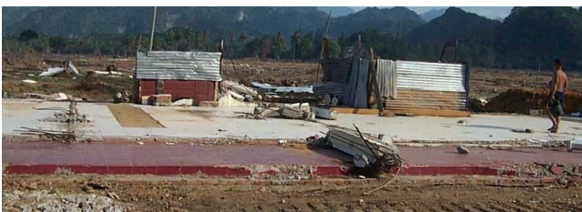
The KUD Office, totally destroyed by the wave 30 metres high - only the red-tile floor remains intact

A large boat, swept 6 kilometres into the city of Banda Aceh by the huge waves