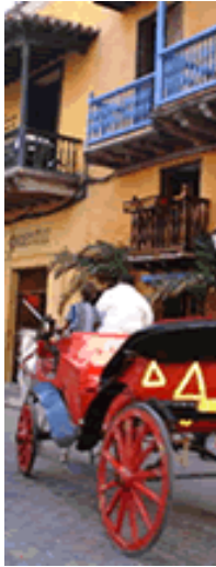
Cartagena is famous for its medieval and colonial buildings.

Cartagena has much to offer the visitor.