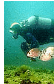
If you like beaches or water sports, then you will enjoy Cartagena!