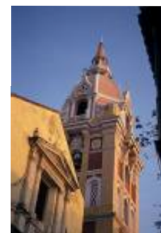
The old city, Cartagena

A special General Assembly website has been set up by the local host organisations. It is in Spanish and English www.icacartagena.coop .