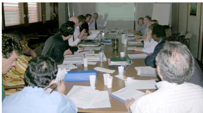
Participants just prior to the signing of the commitment