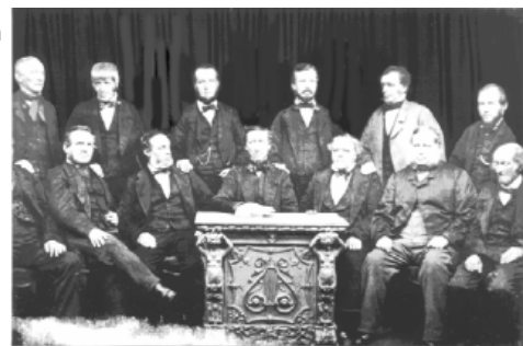
The Rochdale Pioneers