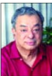
Dr Venghese Kurien, above, chairperson, Na-

Since its introduction in 2000 there have been three winners of the Rochdale Award. tional Co-operative Dairy Federation of India, was the first Rochdale Pioneers prize winner. The award was presented at the General Assembly in Seoul in 2001. The architect of Operation Flood – the world's largest dairy development – Dr Kurien led a "white revolu-