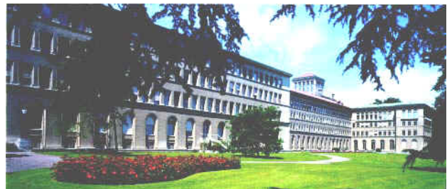
The WTO's headquarters are located in Geneva not far from the ICA's HO

ise markets. It is a short jump to equate support that state trading enterprises provide and how they are supported, to that of how co-operatives help producers and the different treatment that they may be granted, especially