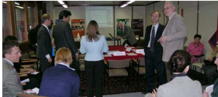
ILO and ICA officials at the start of the 2nd anniversary meeting

Some of the ILO, ICA and joint projects under the MoU for 2006 include: