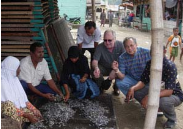
Inspecting the catch of the Bahari Karya fisheries co-operative. The fish are dried, processed and sold by the women from the fishing co-op.

One year after the tsunami hit Banda Aceh leaving destruction and death in its wake, visitors to the area are constantly reminded of the enormity of the disaster. More than 1,150 schools,