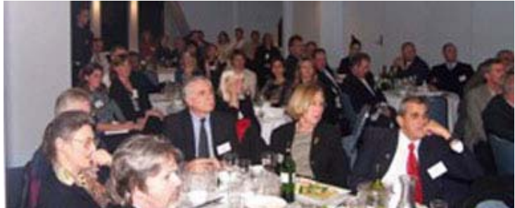
Some of the participants at the recent co-operative dinner in Sydney

keep the co-operative alive. "The members have responded so well to being