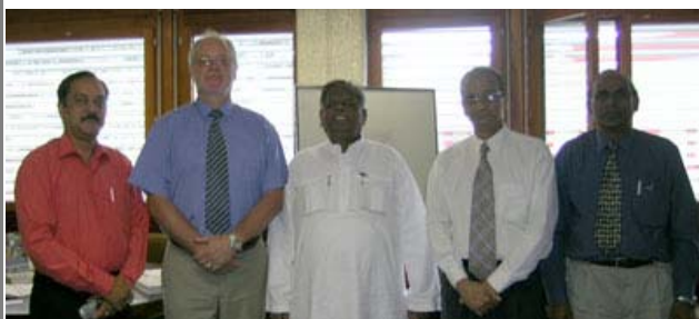
The delegation at the ICA's head office in Geneva

The Minister of State, department of Co-