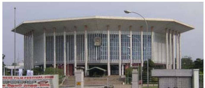
Venue for the Youth Conference

The theme of the conference is “Empowering the youth through co-