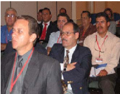
Participants listening to a presentation at the business meeting

This initiative is aimed at establishing a permanent business platform that develops products and services as well as securing commercial ties in fair and accessible conditions.