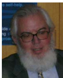
ILO Director- General, Juan Somavia