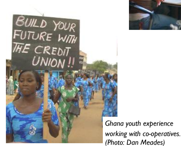
Young co-operators at last year's Building Co-operative Futures Youth Conference.

The 6th Annual Building Cooperative Futures Youth Conference in Vancouver, Canada, will go carbon neutral and 'live' around the world on 2-3 June.