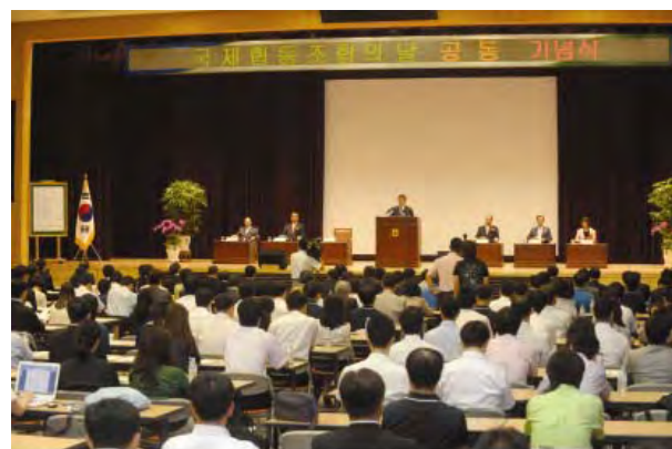
Launch of the Council of Korean Co-operatives

The new Council of Korean Co-operatives was launched on 3 July at NACF headquarters, timed for the IDC celebrations. The Council comprises six ICA members: The National Agricultural Co-operative Federation (NACF), National Forestry Co-operatives Federation, Korean Federation of Community Credit Co-operatives, National