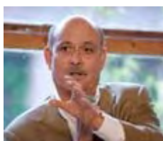
Jeremy Rifkin—ICA GA keynote speaker