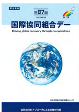
Japanese Co-operative Movement poster for IDC 2009

Federation of Fisheries Co-operatives, National Credit Union Federation of Korea, and iCOOP Solidarity of Consumer Co-operatives.