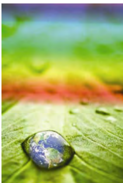
Illustration based on artwork from ©iStockphoto.com/Florea Marius Catalin

'Co-operatives can help pull the world out of recession'