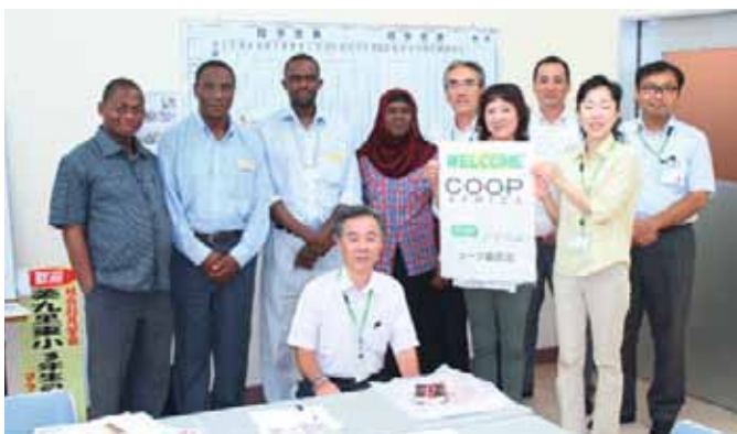
Briefing by Board members and staff of CO-OP Gunma (a consumer cooperative)

Four cooperative stakeholders from mainland Tanzania and Zanzibar visited and learnt about various aspects of the Japanese cooperative movement, such as consumers, insurance, workers, labour bank (Rokin) and agricultural cooperatives. This year, for the first time the participants had a chance to visit Gunma, a rural prefecture in Central Japan, where they were able to observe the whole process of value chains from producers (agricultural cooperatives)