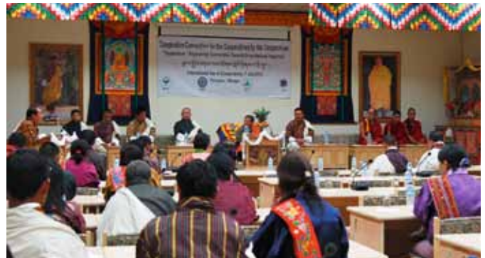
Bhutan celebrated the International Day of Cooperatives for the first time in 2012, bringing together cooperatives and farmers groups.

In 1995, the United Nations declared the first Saturday of July as the International Day of Cooperatives coinciding with the already existing International Cooperative Day celebrated annually by the International Cooperative Alliance since 1923. See more information: http://www.copac.coop/idc .