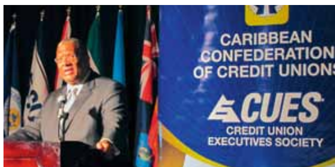
Mr Peter Phillips, Minister of Finance, Jamaica.