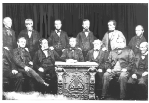
The Rochdale Pioneers