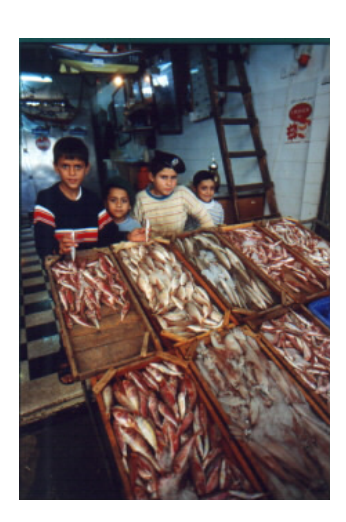
One of the few fishermen's cooperatives in Gaza and Palestine

For more information contact <a href="mailto:nisped@nisped.il">nisped@nisped.il</a>