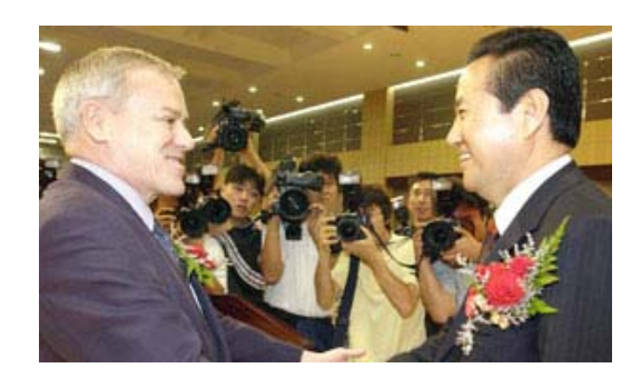
venture company, NACF-CA Investment Trust Management Co., Ltd.