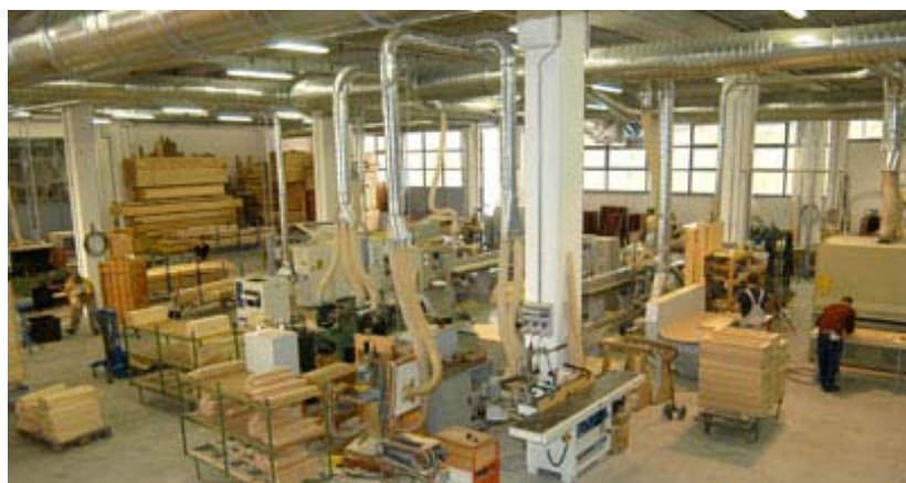
A social co-operative in Italy where disadvantaged people make wooden products

ronment, where all forms of co-operation are recognized, promoted and supported,