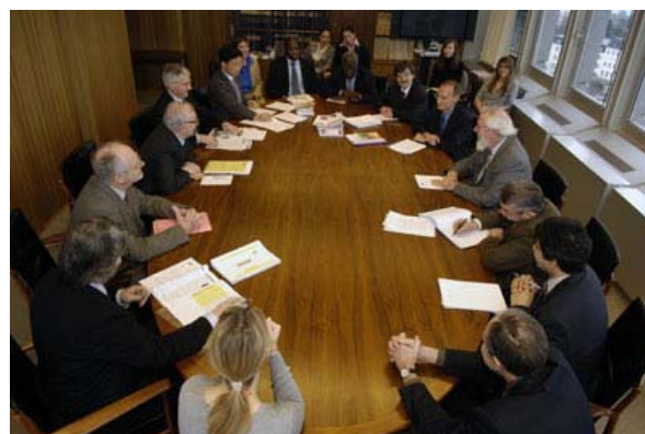
Participants at the 3rd anniversary meeting

The newly redesigned website for the Cooperating Out Of Poverty www.ica.coop/outofpoverty was launched to mark the