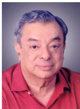
Dr Venghese Kurien, India

The ICA introduced the Rochdale Pioneers Award in 2001.