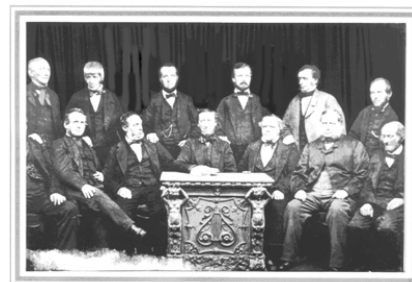
The original Rochdale Pioneers