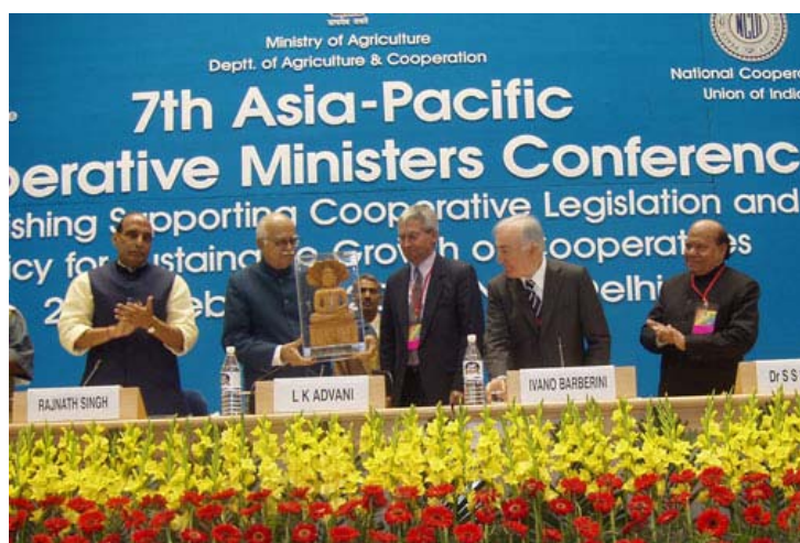
A scene from the last Asia-Pacific Co-operative Minister's Conference

The conference will be rounded out by presentations on Best Business Practices in Co-ops from India (IFFCO, Amul), Korea (NACF), Singapore, (NTUC Fair Price Shops) and Sri Lanka (SANASA). A special session will address Analysis of Co-operative Laws in the Asia-Pacific Region .