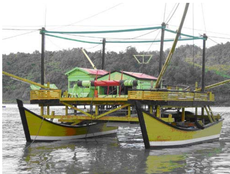
A new fishing vessel made possible with co-operative funds

ICA Asia-Pacific carried out a number of fact-finding missions to the affected areas in India, Sri Lanka and Indonesia. These missions, financed by movements in the UK (UK co-operative movement); Singapore (NTUC Income); Israel, Negev Institute for Strategies of Peace and Development (NISPED); and other countries, resulted in project proposals that were shared with co-operative development agencies and members. The UK, Singaporean and Israeli movements