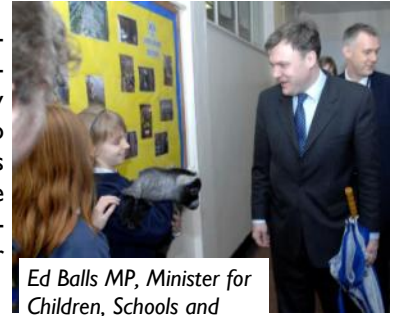
Ed Balls MP, Minister for Children, Schools and Families

Trust offers an inspirational opportunity for pupils, staff, community members and partners to share the strong values and principles which have been the basis of the co-operative movement for more than 150 years."