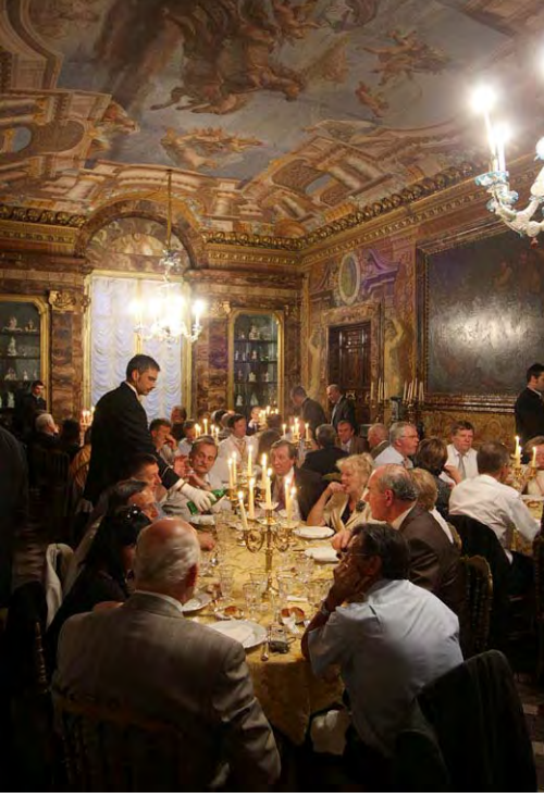
Palazzo Taverna, venue for the Gala GA dinner