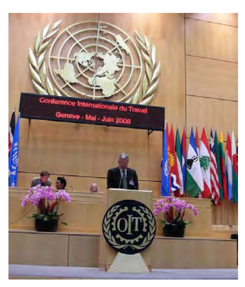
D-G lain Macdonald delivering ICA 's statement to the ILO Conference at UN head-quarters in Geneva

Download a transcript of the speeches at <a href="www.ica.coop/activities/un/index.html">www.ica.coop/activities/un/index.html</a>