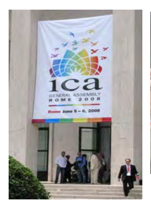
Salone delle Fontane