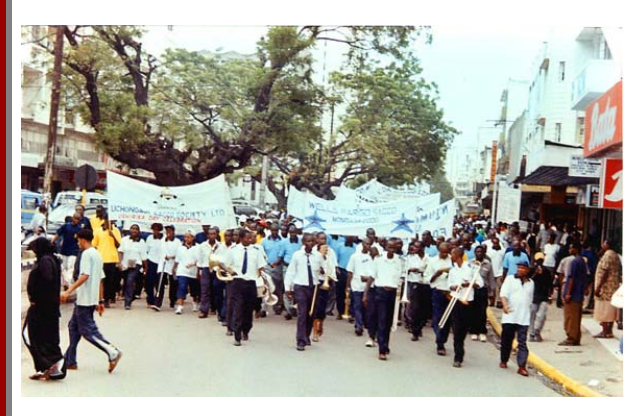
Co-op Day 2008 celebration in Mombasa District, Kenya

Events held this year to celebrate the Day were aimed at strengthening efforts for sustainable development and combating global warming. In Brazil, a seminar on Sustainable Development and Cooperatives was an opportunity to show how cooperatives can work in partnership to continue to tackle climate change. At the seminar, the Organisation of Brazilian Co-operatives (OCB)