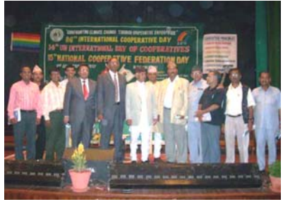
National celebrations Nepal for Co-op Day 2008

Poster produced by the Japanese Joint Committee to celebrate Co-op Day 2008