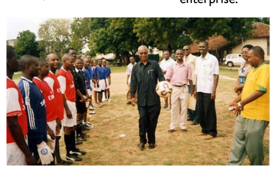
Ushirika Football Tournament helped raise awareness of Co-op Day 2008, Kenya

Nepalese cooperatives received awards for excellence in co-operative enterprise.