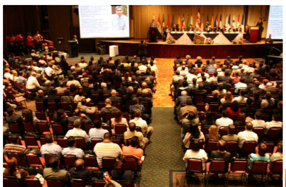
Delegates at the opening of ICA Americas regional conference in Costa Rica

Regional Conference concluded on a high note on 25 July in San José, Costa together with international guests from Italy, Spain, the four-day event.